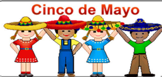
Cinco de Mayo